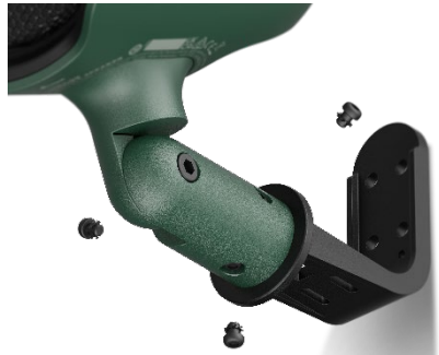
(GSF SPEAKER shown with L-BRACKET BASE)