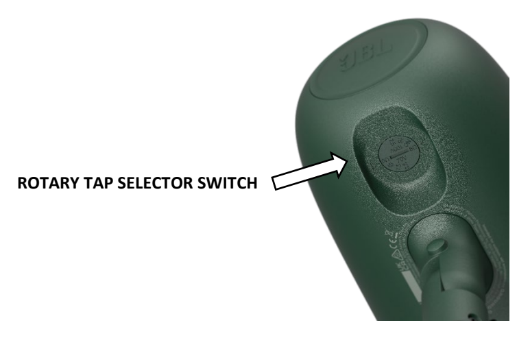
(TAP SELECTOR SWITCH is located on the bottom of the speaker enclosure)